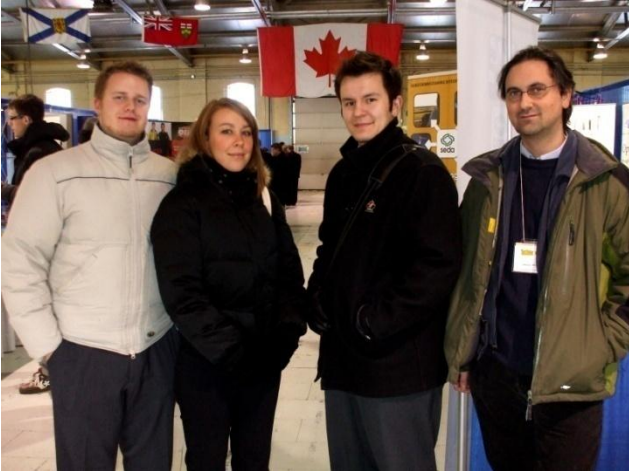
At the tradeshow for the Prince Albert Economic Development Summit

Some or all of us went to several other conferences including the Saskatchewan Urban Municipalities Association (SUMA) and the Saskatchewan Association of Rural Municipalities (SARM) in Regina, and the Canadian Community Economic Development Network (CCEDnet) Conference, the Duty to Consult Roundtable discussions, and the Federation of Saskatchewan Indian Nations (FSIN) Winter Assembly in Saskatoon.