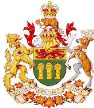
LEGISLATIVE ASSEMBLY OF SASKATCHEWAN