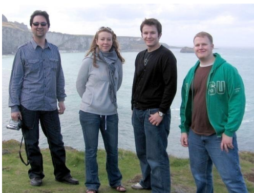
Visiting the Carrick-A-Rede Rope Bridge in Northern Ireland