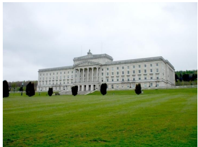
Stormont Estate, the home of the Northern Ireland Assembly

Although our trip was about two and a half weeks, it didn't seem long enough and before we knew it, we were back in Saskatchewan. We all wish we could go back to Ottawa and the UK some day. We were very privileged to go on such a great study trip and we can't wait to hear where the 2009 interns will go!