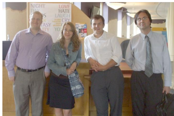
At the Globe Theatre after our meeting with the General Manager