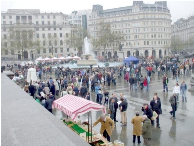
Trafalgar Square during St. George's Day

In London we also visited Canada House in Trafalgar Square. We were given a full tour of the House, and we talked about UK-Canada relations with one of the senior members of the foreign service.