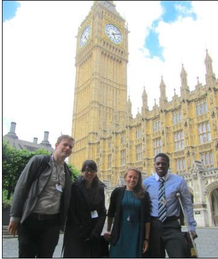
2014 Saskatchewan Legislative Interns in London

In 2014, the interns’ comparative study tour was divided into separate Canadian and international trips. The Canadian trip occurred from February 19 to 27, 2014, and involved meetings in Québec City and Ottawa. The international trip occurred from May 26 to June 4, 2014 and involved stops in Edinburgh (Scotland), and London (England). A list of meetings and events attended by the interns during their tour is provided in Appendices B and C.