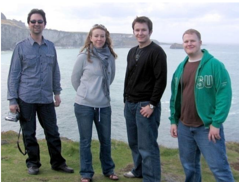
Visiting the Carrick-A-Rede Rope Bridge in Northern Ireland